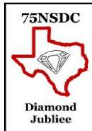
75th National Square Dance Convention