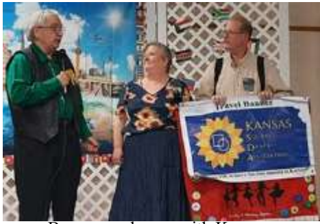
Banner exchange with Kansas