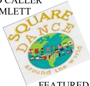
FEATURED CUER MITCHELL THOMPSON