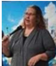
WELCOME TO HASTINGS Angel—Adams Fairgrounds