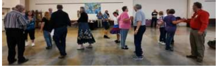
Local callers hall Saturday afternoon