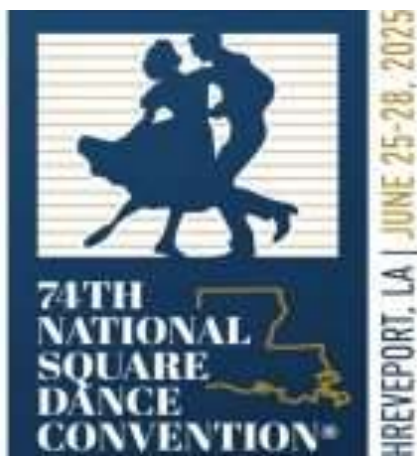
74 National Square Dance Convention

Thank you for supporting ALL the National Conventions!