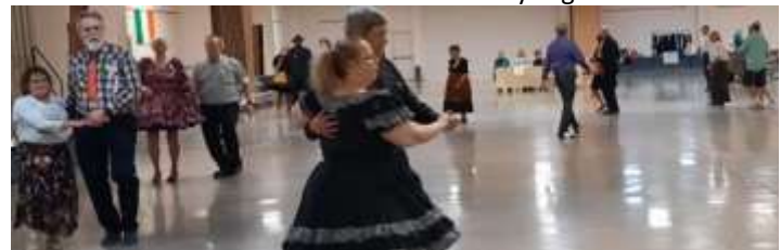
Round Dancers Main Hall Friday Night