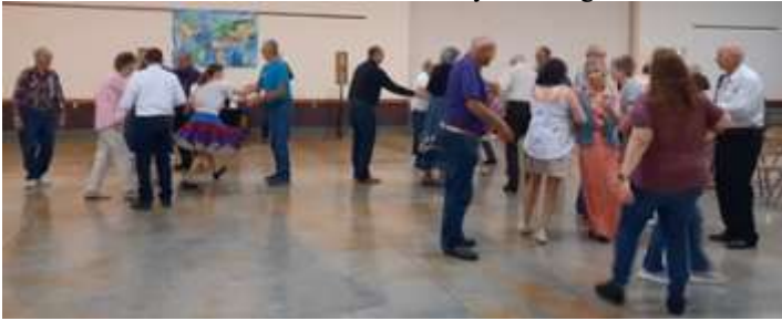
Local callers hall Saturday morning