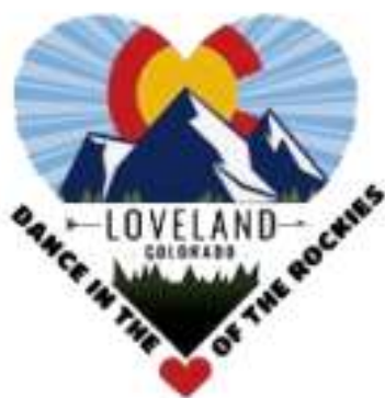
76th National Square Dance Convention