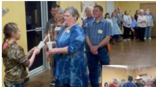
Lighting the candle at the third corner of the Four Corners Ceremony

Loess Hills Squares held their graduation for their one lesson on April 5 th . We had other club lessoners there who were graduating so they were included in our Four Corners Ceremony and all of the dancers in attendance participated in the Square Dancers Pledge. This was our biggest dance since we started dancing at The Parlor 3-4 years ago. Loess Hills Squares would like to thank all the dancers for coming and CONGRATULATIONS and WELCOME to all the new graduates.