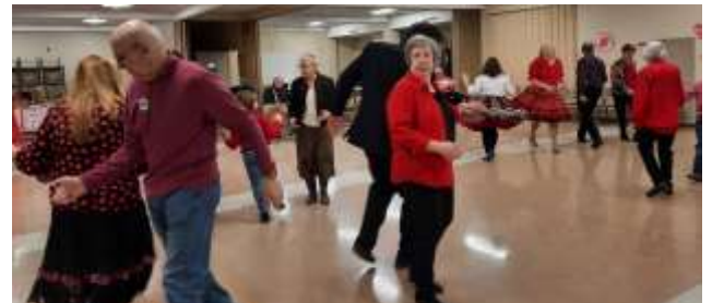
There were 3 or 4 squares on the floor most of the afternoon.