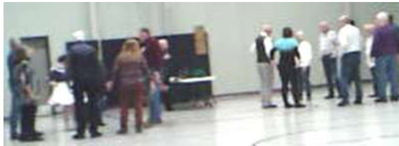
Dancers on the floor ready to dance at the River City Squares dance.

Due to the fact there were no round dancers at this River City Squares dance, line dances were done between tips. The Hokey Pokey was put on while waiting to see what line dance was next. The two young men in this group of dancers came running onto the floor, so a group did the Hokey Pokey.