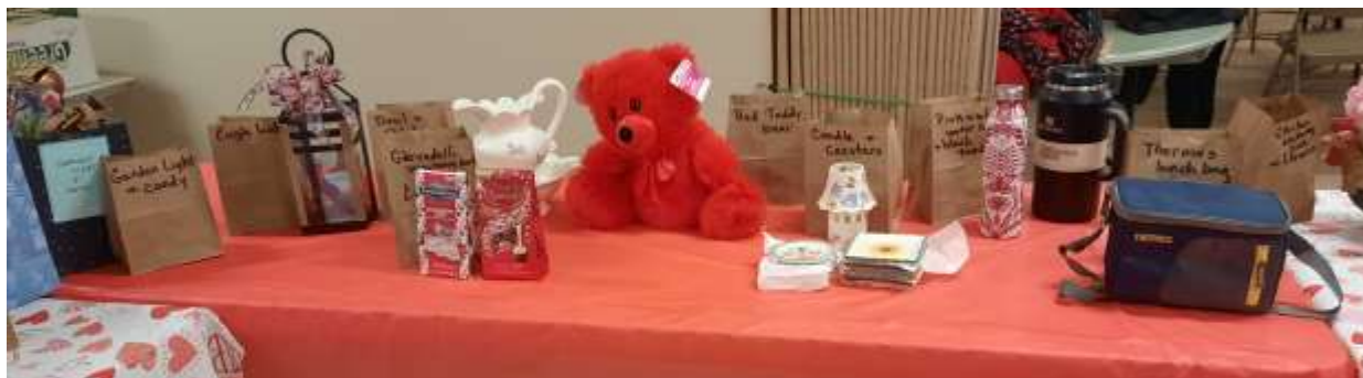
Just a few of the raffles