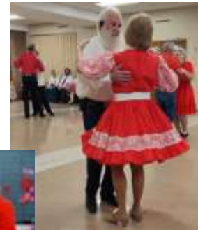
Round Dancers enjoying the rounds