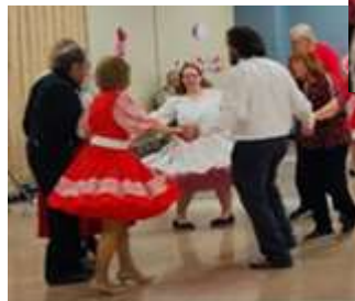
Square dancers young and old enjoyed the dance.