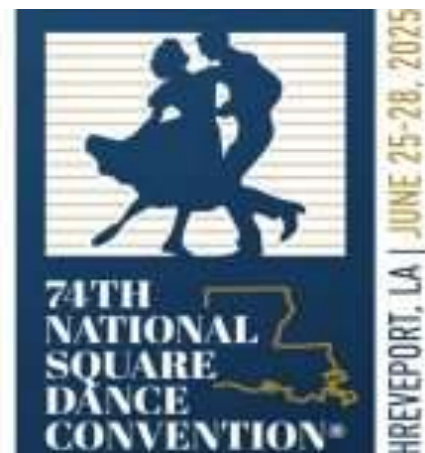
74 National Square Dance Convention