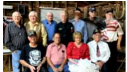
Veterans recognized at our dance