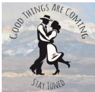
76th National Square Dance Convention link coming to the next Roundup Issue