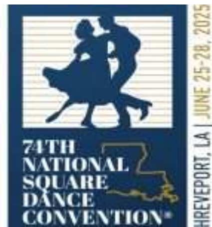
74 National Square Dance Convention